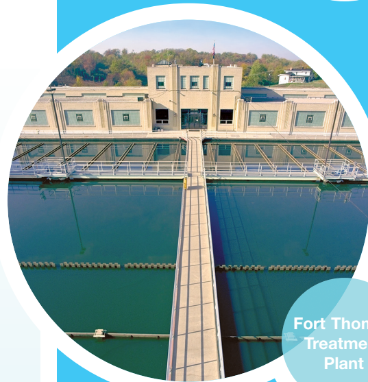
Fort Thomas Treatment Plant