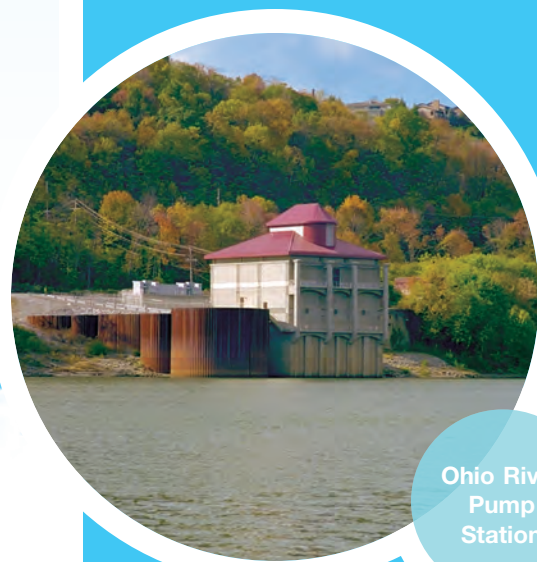
Ohio River Pump Station

The surface water sources for NKWD are the Ohio and Licking rivers. A source water assessment has been completed on each. The following is a summary of the susceptibility analysis that is part of the source water assessment. Several areas of concern are related to the extensive development of transportation infrastructure, the potential for spills, high degree of impervious cover and polluted runoff. Areas of row crops and urban and recreational grasses introduce the potential for herbicide, pesticide, and fertilizer use – possible nonpoint source contaminants. Bridges, railroads, ports, waste handlers or generators, and Tier II hazardous chemical