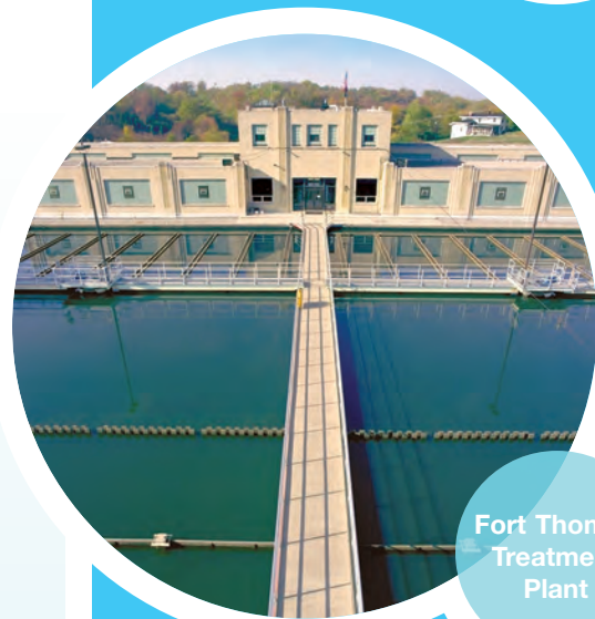
Fort Thomas Treatment Plant