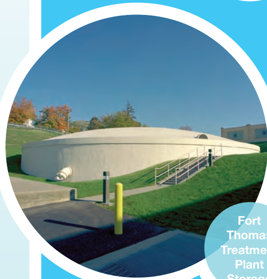
Fort Thomas Treatment Plant Storage