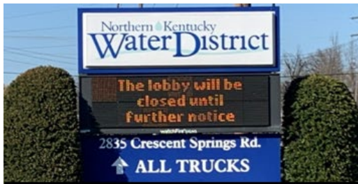
Serving Customers with...