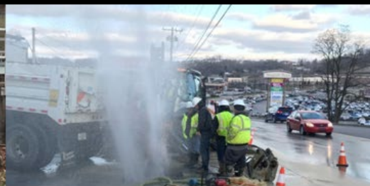
Distribution System Repair